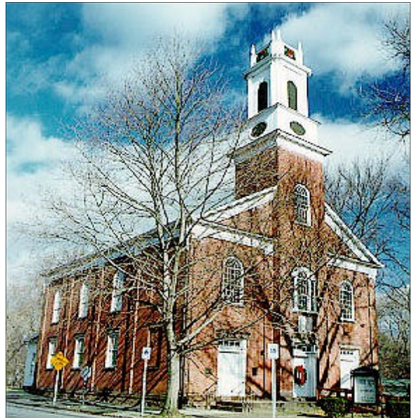
The Tappan Reformed Church Tappan, New York

The 80th Annual Meeting and Reunion will take place on Saturday, September 16, 2006 in Tappan, New York. We hope to see you at this historic reunion as we return to the birthplace of the Blauvelt Family in America.